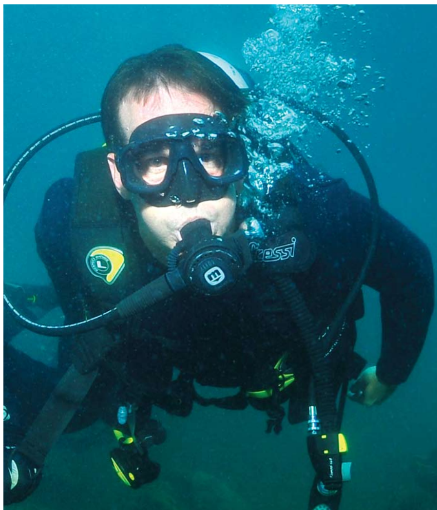
Senator Atwater checks out the LBTS reef.

All content is protected by copyright laws. Reproduction of any and all content is not permitted unless express written permission is granted.